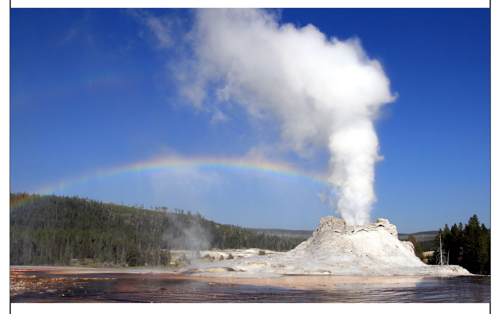
A geyser releases hot water and steam into the air.

Geothermal energy is heat inside the Earth. Geothermal energy is renewable.